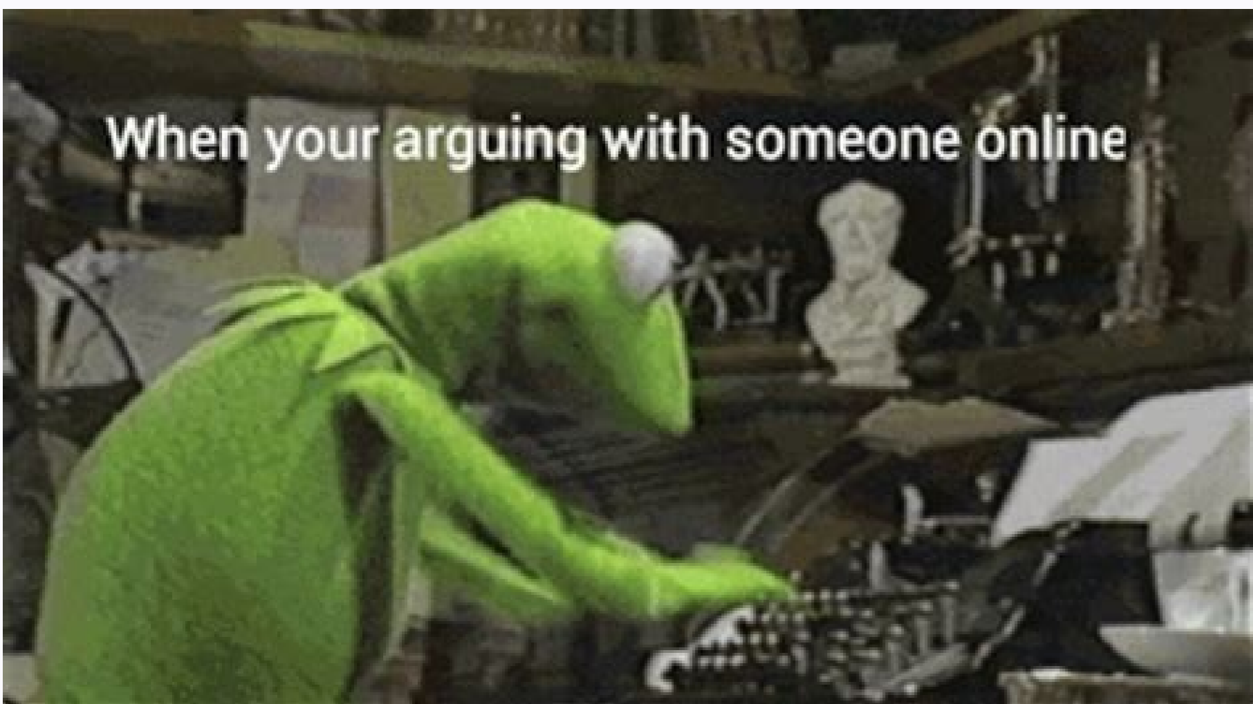
Kermit the frog angry typing gif. Kermit typing gif ingur. Kermit typing gif download. Angry kermit typing gif. Kermit the frog typing meme gif. Kermit the frog typing gif. Kermit frantically typing gif. Kermit typing fast gif.